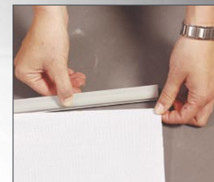
Mount the snap rail on top of the banner.