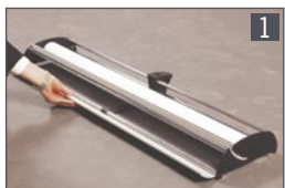
Hook the panel on bottom rod