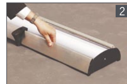
Snap-lock panel on top rod