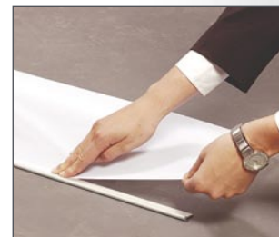
Mount the bottom rail on the reverse side of the banner.