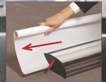
Slide the banner out