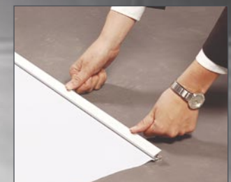
Close the rail.