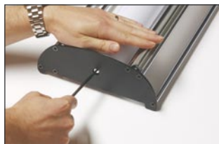
All cassettes are pretensioned before delivery.

If adjustment is needed, hold the cassette firmly in place then depress and turn the adjusting screw clockwise to increase the tension (the tension mechanism adjusts in halfturn increments). Slowly release pressure on the screw turning slightly counter-clockwise and allow it to again lock in place. If tension has been lost completely, we recommend 20-25 full clockwise turns.