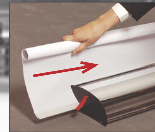
Slide the bottom rail into the cassette.