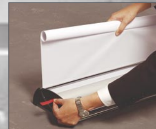
Roll the old banner out of the cassette and insert the locking pin.