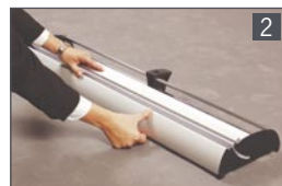
Snap-lock panel on top rod