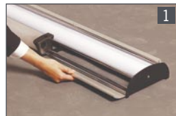
Hook the panel on bottom rod