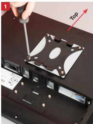
Attach the holder to the LCD...