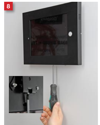
For extra security lock the LCD with the screw.