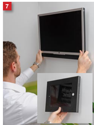
Hook on the LCD or iPad holder