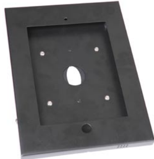
iPad holder Item 80027