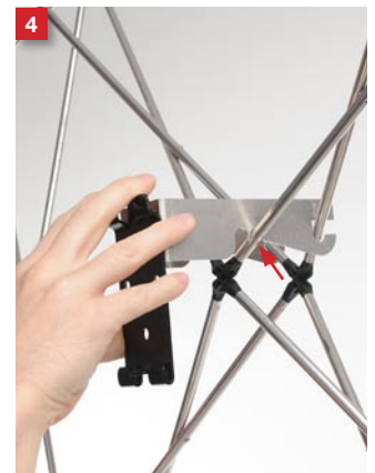
Lower the holder into position.