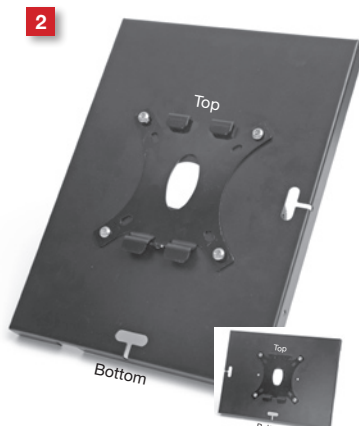
... or to your iPad holder vertically or horizontally.