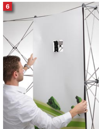
Attach the graphic panel