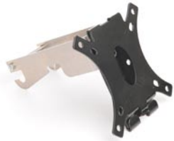
Media screen holder Item 82579 VESA 75/100 Max. weight 8 kg / 17.6 lbs.