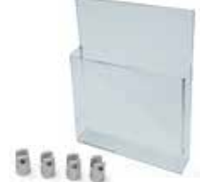
Literature holder Item IS-9318