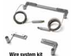
Wire system kit Item Midi IS-9312 / Maxi IS-9312