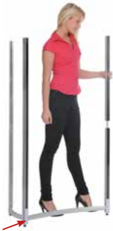
1 Replace the end post of your existing display wall with the new post from your graphic wing module.