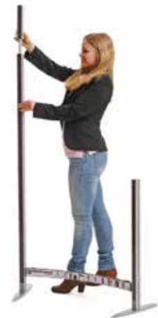
4 For Maxi height, add the short extension post before mounting the top post section.