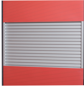
With corner trims