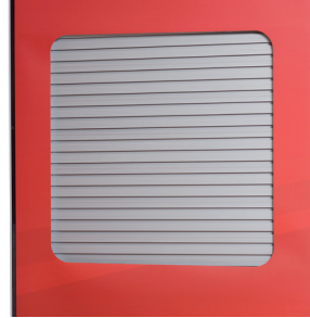
With graphic panel cut out