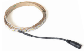
Deco light strip, item IS-9385