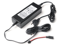
Transformer, item IS-9388