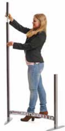
4 For Maxi height, add the short extension post before mounting the top post section.