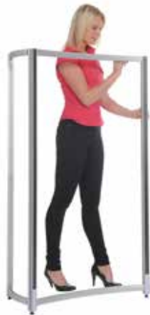
2 Mount the first 200 mm beam at the bottom