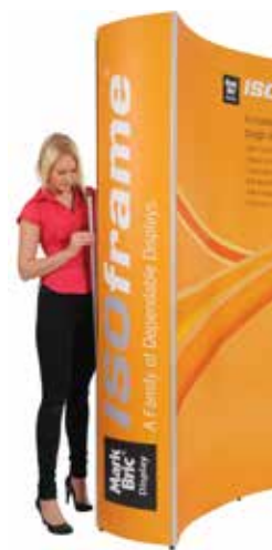
6 Complete your module by installing corner trims along both edges of the new graphic wing.