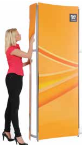
5 Attach the graphic panels