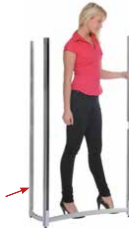
3 Use the 200 mm beams to connect the end post you removed and replaced in step 1.