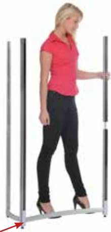
1 Replace the end post of your existing display wall with the new post from your graphic wing module.